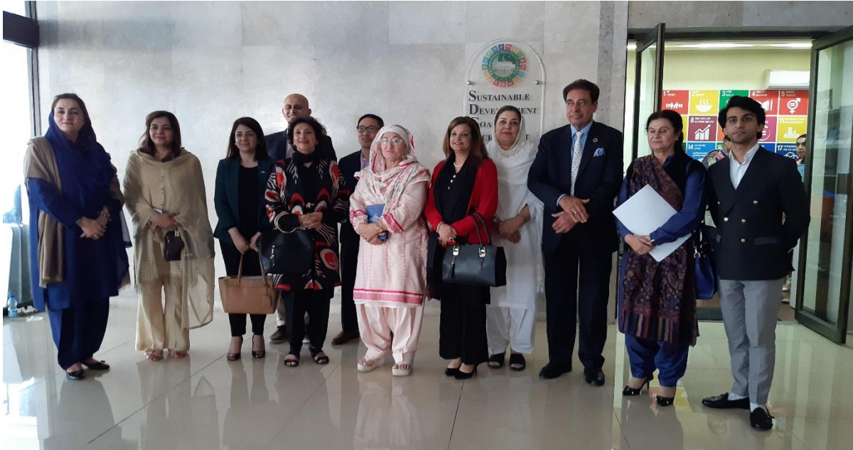
March 03, 2020: Members of the CR Special Committee along with Facebook team at the SDGs Secretariat.