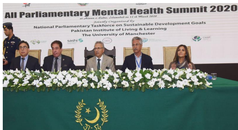
March 12, 2020: President Dr. Arif Alvi inaugurating the All Parliamentary Mental Health Summit.