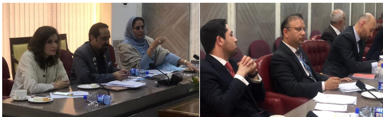
February 13, 2020: Members of the National Assembly and Senate in a meeting with private sector and businesses at the Parliament House – Islamabad.