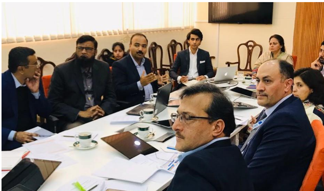
February 25, 2020: Meeting of the Sub-Group on SDGs Scorecards, presentations from provincial SDG Units.

In this regard a meeting was held on February 25, 2020 to consult with provincial SDG Units. Given the wide magnitude of the task at hand, the Federal Ministry of Planning, Development and Reforms has joined to technically assist the Task Force. The scorecard will be a one- window information solution on SDGs at the constituency level, while simultaneously ensuring a feedback mechanism. Former Provincial Minister for Finance, Hon MNA Dr. Aisha Ghaus Pasha, chairs the Sub-Group.