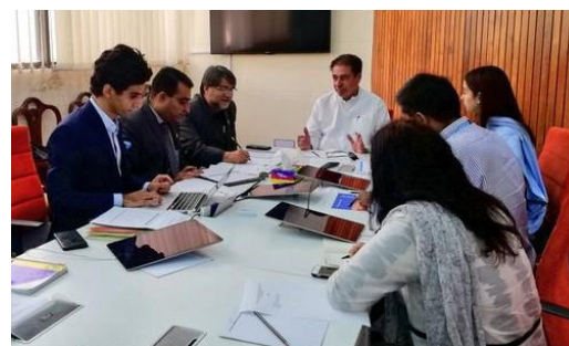
Jan-Feb2020: Weekly preparatory meetings of the International Conference on SDGs