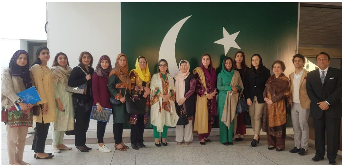
February 17, 2020: Afghan delegate alongside Women Members of the SDGs Task Force and Secretariat team.